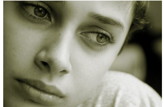
PHPC Patients-Mental Health Diagnosis 2010